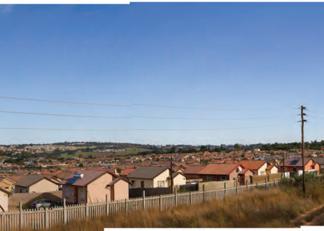
Cosmo City, Johannesburg Gauteng, South Africa